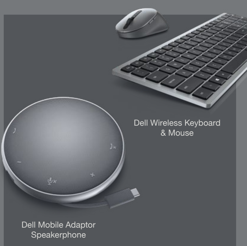
Dell Wireless Keyboard & Mouse

Shop Dell laptops, including the award-winning XPS 13 with 11th Generation Intel® Core™ i7 Processor.