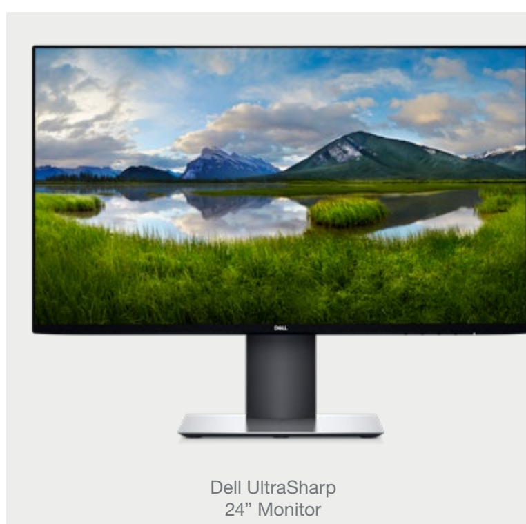
Dell UltraSharp 24" Monitor

Stay focussed while working at home or in the office with state-of-the-art electronics and accessories.