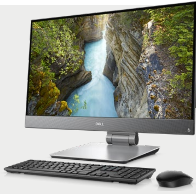
OptiPlex 7780 All-in-One